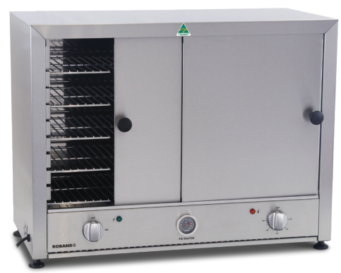
PM100S has stainless steel doors and a stainless steel back