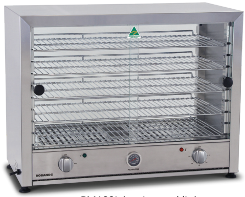
PM100L has internal light