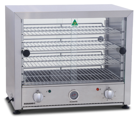
PM50G has glass doors both sides